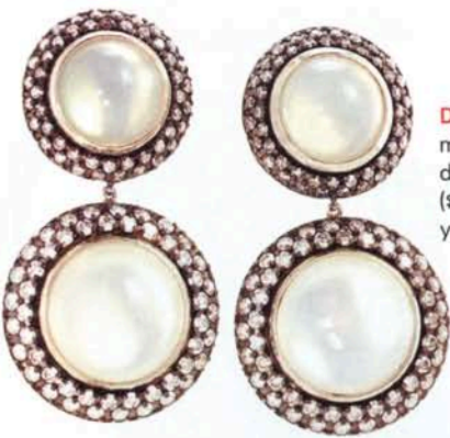
DAVID YURMAN moonstone and pavé-diamond earrings ($4,700), davidyurman.com.