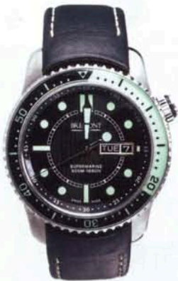
BREMONT stainless-steel Supermarine 500 watch ($4,999), at Tourneau Time Machine, NYC, 212-758-7300.