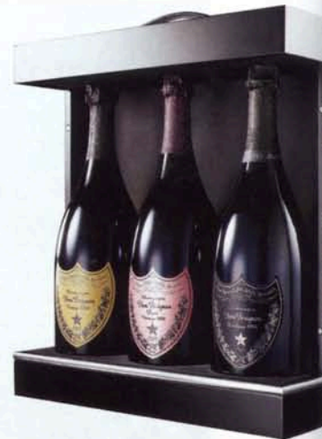
DOM PÉRIGNON Power Trio ($1,500), at Sherry-Lehmann, NYC, 212-838-7500.