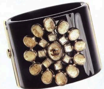
CHANEL metal and Plexiglas bracelet ($1,305), 800-550-0005.