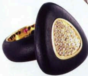
ROBERTO COIN ebony and cognac-diamond ring ($1,750), at Saks Fifth Avenue, NYC, 877-551-SAKS.