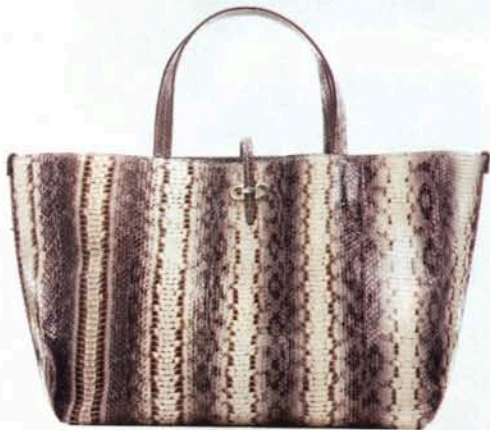
SALVATORE FERRAGAMO snakeskin tote ($1,490), 212-759-3822.