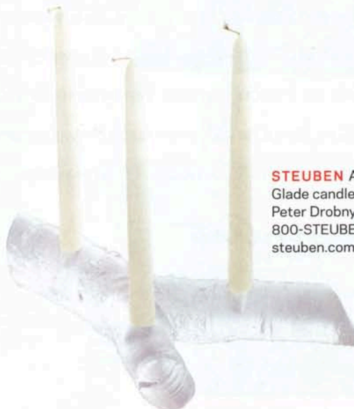
STEBUEN Aspen Glade candleholder by Peter Drobny ($4,000), 800-STEBUEN; steuben.com.