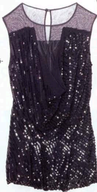
MAXMARA sequined blouse ($1,090), 212-879-6100.