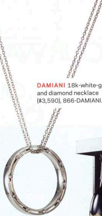
DAMIANI 18k-white-gold and diamond necklace ($3,590), 866-DAMIANI.