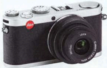
LEICA X1 high-performance digital camera ($1,995), leica-camera.com.